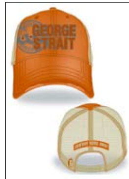
2755 - Orange Mesh Cap