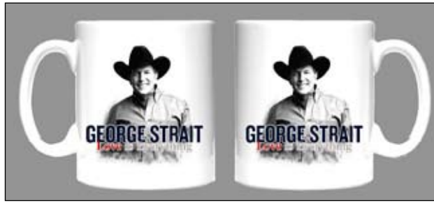
1145 - White Photo Coffee Mug