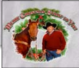
9100 - Christmas Sweatshirt