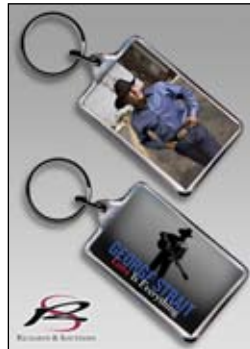
543 - Photo Keychain