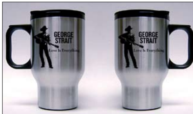
1015 - Stainless Steel Travel Mug