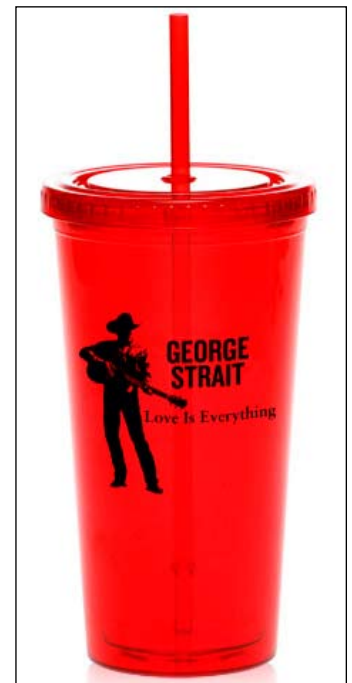
1030 - Tumber (Double Wall Acrylic)