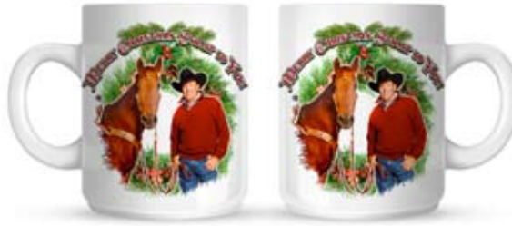
1054 - Christmas Photo Coffee Mug