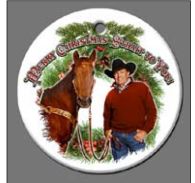
346 - Christmas Ornament

~ SWEATSHIRTS WILL BEGIN SHIPPING ON OCTOBER 8TH ~ ~ MUGS AND ORNAMENTS WILL BEGIN SHIPPING ON OCTOBER 15TH ~