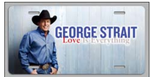
564 - License Tag