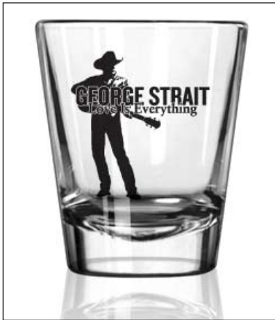
1018 - Shot Glass