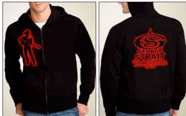
8950 - Black RED GLOW Zip-Up Hooded Sweatshirt