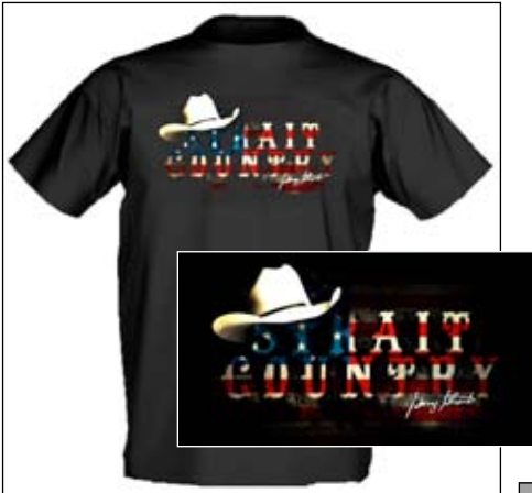
4345 - Black Strait Country T-Shirt