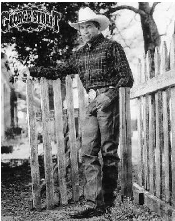
#7035 - Afghan