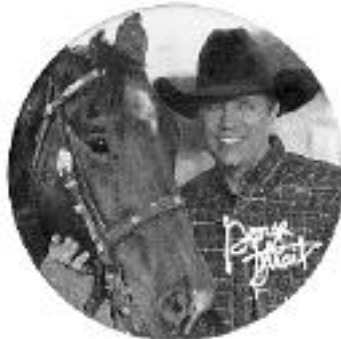
#1025 - Trivet