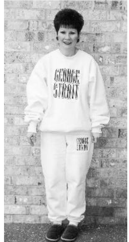
# 8060 - Sweatshirt • # 8050 -