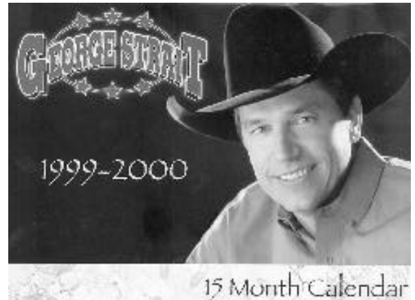
# 638 - New 15 Month Calendar January 1999 - March 2000

FAN CLUB # - 1-615-824-7176 MONDAY - FRIDAY 9 A.M. - 5 P.M. ORDER DESK # - 1-800-338-4732 FAX # - 1-615-822-2527