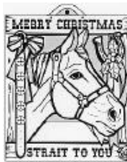
#406 - Christmas Ornament